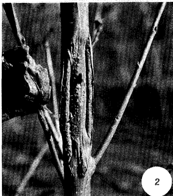
Fig. 1, 2. Main stem cankers on 'Robusta poplar' caused by Phomopsis macrospora .