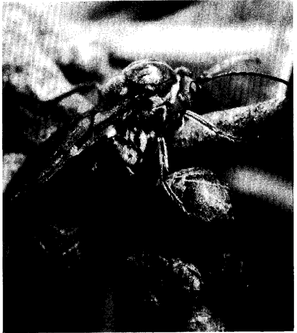
Fig. 2. A female D. cinerosa of the asexual (parthenogenic) generation seeks out swollen buds in which to oviposit.

Like many other kinds of gall-forming insects, D. cinerosa are highly host-specific, occurring only on the live oak species. Where these trees are planted in urban areas of Texas, several distinctive patterns of infestations can be easily observed. First, only about 1 in 16 trees shows significant susceptibility to the insect, yet occasional trees produce extremely large numbers — up to 10,000 per tree. Most, however, produce moderate to low numbers, and a few have no galls. Second, individual trees within most plantings represent a mixture of infestation levels. Third, relatively non-susceptible trees maintain their state of infestation, even in close proximity to susceptible trees; and, finally, the capacity to form galls apparently diminishes through time in susceptible trees. Thus the homeowner and ar-