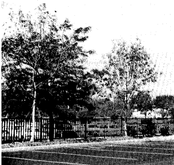
Fig. 1. Tree planting and fence installation as required by the screening and landscape section of our zoning ordinance.

Let's follow a typical request for a permit to the construction of a parking lot or the expansion of a current parking lot. The South Park Church in Park Ridge, which is located in a single family zoning district, requested a permit to remove existing single family homes that they owned in order to construct a paved parking lot. In addition to a paved surface plan for the parking lot, they also must prepare a landscape plan that is submitted to the City Forester for review and approval prior to the issuance of the building permit. The required number of trees, which is based on the square footage of the paved parking lot, must be placed in the parking lot area. The perimeter of the park-