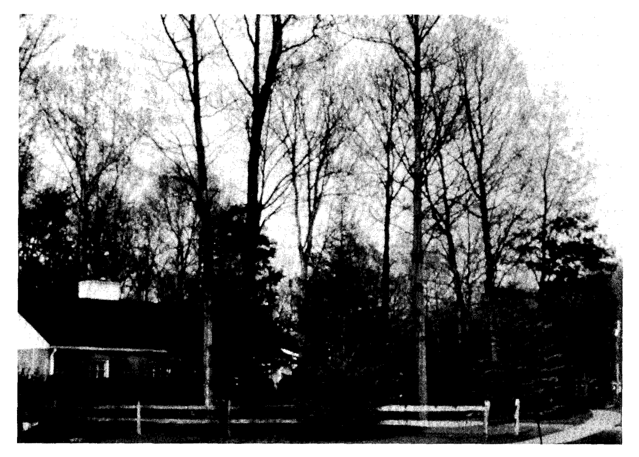
Fig. 2. Residential area defoliated in early July. Note heavy defoliation in tops of conifers as well as on hardwoods.

The larvae change behavior about halfway through their development. At about the 3rd or 4th instar, or when the larvae are about ¾" or 1" long, they become nighttime feeders. During the daytime, they crawl down from the crowns of the trees to seek a protected or concealed place during the daylight hours.