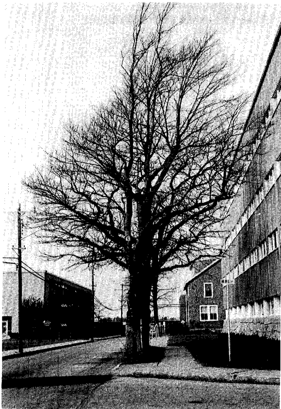
Figure 1. Urban shade tree growing in conditions of restricted root space.

Stress can be defined as a detrimental force or