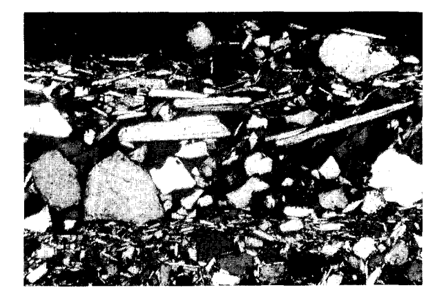
Figure 1. Crusting phenomena in the upper 2 millimeters of a barren soil surface. The picture shows two crusted layers, in which most of the finer soil particles are oriented parallel to the soil surface. Voids appear black. Photographed under circular polarization. (30 \times, 1 \text{mm} = 3 \text{cm})

ed leaching; rather than any one factor in isolation. Since a large portion of a healthy root system is concentrated near the road, a root/shoot imbalance may be set up if root kill at that location becomes pronounced.