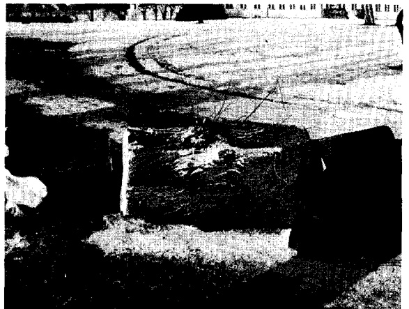
Fig. 1. Cutting up trees in cross sections as well as longitudinal sections gives information on the development of decay.

It became a serious problem for me since I was running a tree expert company with a rather profitable tree surgery division and a rotacutter pro-