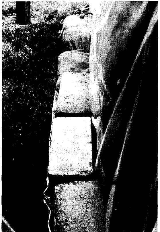
Figure 2. Two possible methods of sealing woodpiles are shown here; placing sandbags or concrete blocks on the excess polyethylene.