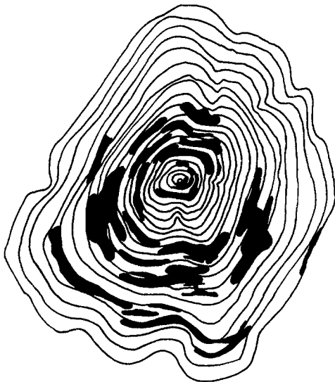
Figure 1. Schematic diagram of carpenter ant nest workings in a cross-section of a trunk. Note that the gnawed out portions follow the general pattern of the growth ring.

Effects of carpenter ant nesting on shade trees. Because a high percentage of urban shade trees are used as nesting sites by carpenter ants, their nesting activity poses several problems. In forests, carpenter ant nests have been implicated as contributing to wind breakage (Graham 1918; Felt 1928; Schread 1952). The effect of tree size and carpenter ant nesting on wind breakage has recently been documented for urban trees (Fowler and Roberts 1982). However, unless the tree is highly exposed, and nest excavations are extensive, wind breakage should not present a substantial problem, as the incidence of wind breakage of trunks and major limbs is not high. However, in exposed situations where wind