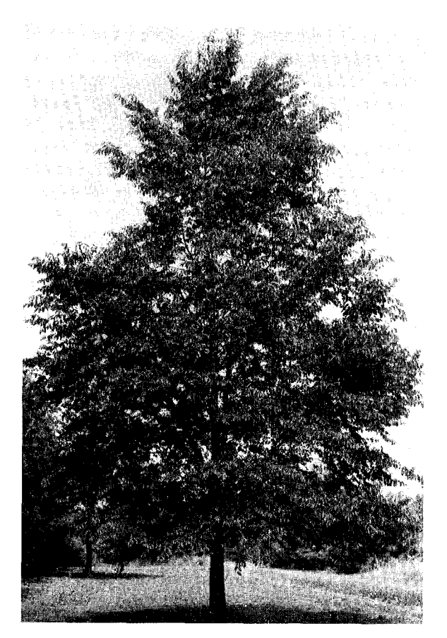
Figure 1. Selection 470. A fast-growing hybrid with resistance to Dutch elm disease. Currently being evaluated by several nurserymen and arborists.

Dr. L.R. Schreiber, Research Plant Pathologist and Research Leader at our station, has released one disease-resistant cultivar, the 'Urban' elm. Many other disease-resistant selections are currently being tested but no release has been made pending further trials. Included among these clones under test are No. 470, a complex hybrid ( U. pumila ) \times [( U. hollandica 'Vegeta \times U. car pinifolia ) \times ( U. pumila \times U. carpinifolia )] which is dense, dark green and fast-growing (Fig. 1).