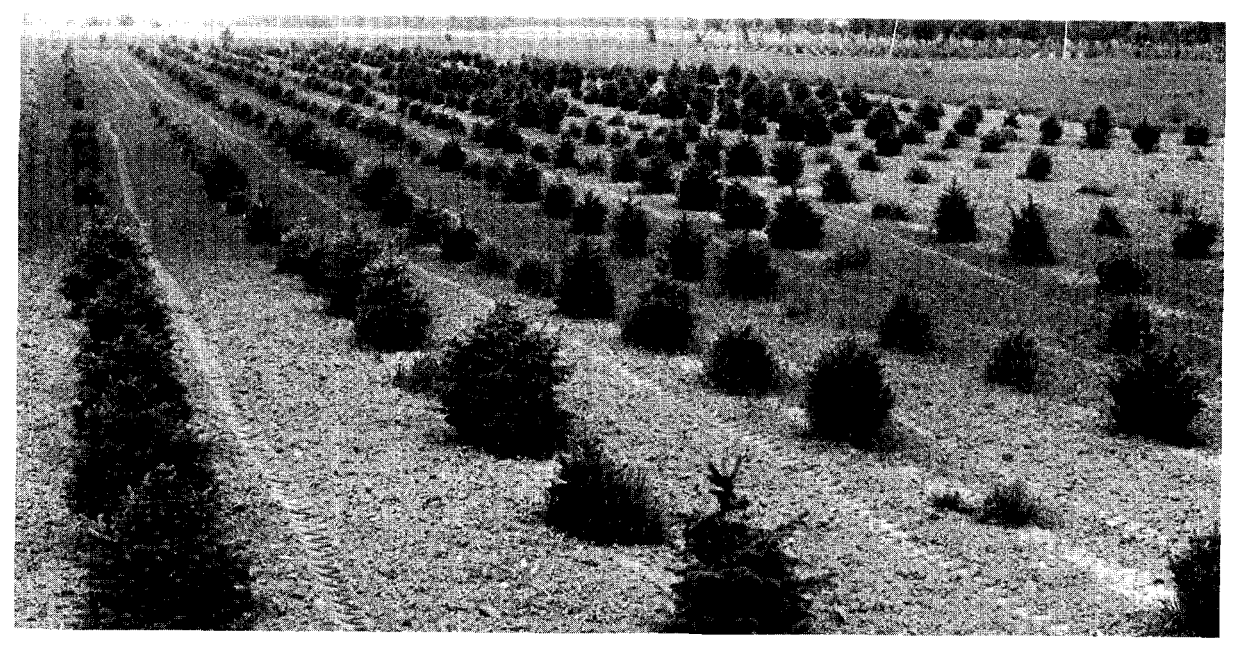
Figure 4. The Colorado blue spruce planting of 32 seed-spruce progenies at Delaware, Ohio. Seedlings in this planting have been grown from seed collected in Utah, Colorado, Wyoming, Arizona, and New Mexico.

parison purposes, are seedlings from 2 seed sources of Italian alder, Alnus cordata (Loisel.) Duby. In spring of 1982 we will be sending out seedlings from all of these same seed sources to one or more cities for outplanting and measurement of their relative performance under city conditions. Research results should eventually enable us to recommend to nurserymen those sources of seed which will result in the most desirable urban planting stock.