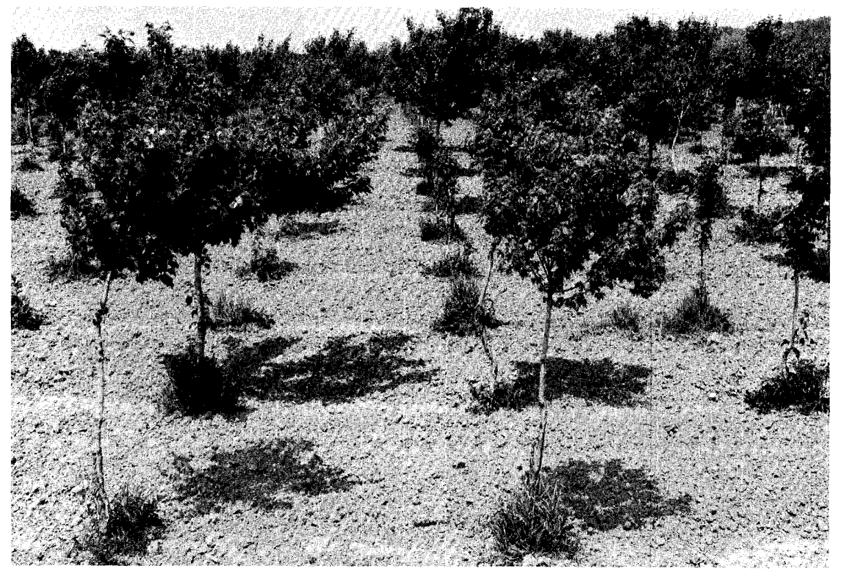
Figure 3. The 8-acre red maple plantation near Delaware, Ohio. This planting contains trees grown from seed collected from 51 different geographic locations.

Interest in European black alder (Alnus glutinosa) as an urban tree has recently increased because of its fine performance in several American cities. It is fast-growing and vigorous, with dense dark green foliage and an ability to fix its own nitrogen. With a natural range that extends over most of Europe into Asia Minor, this species shows much potential for future genetic improvement. In April, 1981, at our laboratory, we outplanted seedlings grown from seed collected from 12 seed sources. Seed was contributed by Dr. Richard Hall, Iowa State University, and Dr. Kim Steiner, The Pennsylvania State University. Seed sources included specific locations in Iran, Bulgaria, Italy, Yugoslavia, Spain, France, Ireland, Scotland, Denmark, West Germany, Poland, and USSR. Also included in our outplanting for com-