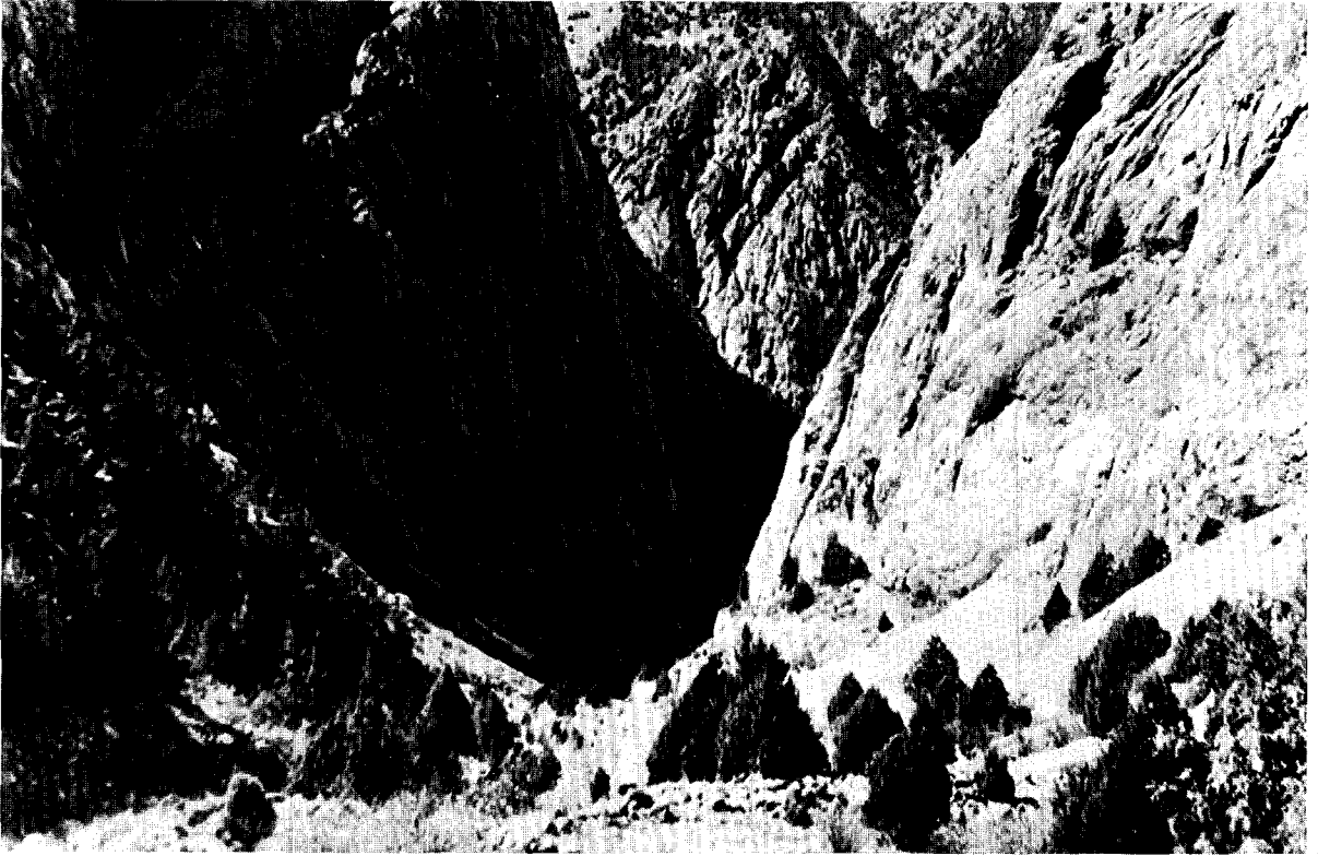
2. High altitude forests of Juniperus semiglobosa and darker crowns of Juniperus seravschanica near Iordan in the Pamir-Alai Mountains of Tadzhikistan.

In the lower valleys of the Varzob Gorge north of Dushanbe there is a rare opportunity to see naturally occurring a tree that has been domesticated, the plane (sycamore). In various Soviet floras this tree is often named as Platanus orientalis which has distinctive deeply lobed leaves and having long styles although modern authors and local botanists agree to the correct name being P. orientalis .