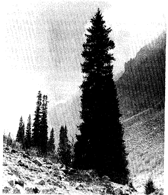
5. Picea schrenkiana and Sorbus tienschanica in the Tien-Shan Mountains south of Funje in Kirgizia.