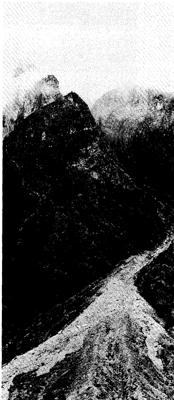
1. Pamir-Alai Mountains near Khamzaabad south of Fereana (habitat area for Sorbus tianschanica and Betula tianschanica ).

The higher north faces of the Pamir-Alai mountains are often thickly covered with juniper forests of three species. The lower altitudes are dominated by the dark dense conical crowns of Juniperus seravschanica , and the middle and higher areas give way to the more open light green crowns of J. semiglobosa (Fig. 2). The latter is distinctive in having pendulous branchlet tips and smaller cones. The high altitude species, J. turkestanica , forms a slow-growing globular shrub. Some of the junipers attain large proportions and are reputed to attain an age of up to 2,000 years. In more open areas within the junipers, Sorbus persica are found and at higher elevations S. tianschanica . Betula tianschanica form groups of showy trunks, creamy white with shades of pink peeling bark, among the dark juniper foliage, and on grassy slopes near recently melted snow spring numerous minute white stars of Colchicum kesselringii (Fig. 3).