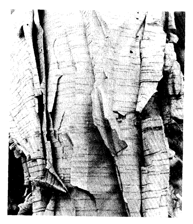
Betula tienschanica trunk with cream and tinted pink unfolding layers of bark.