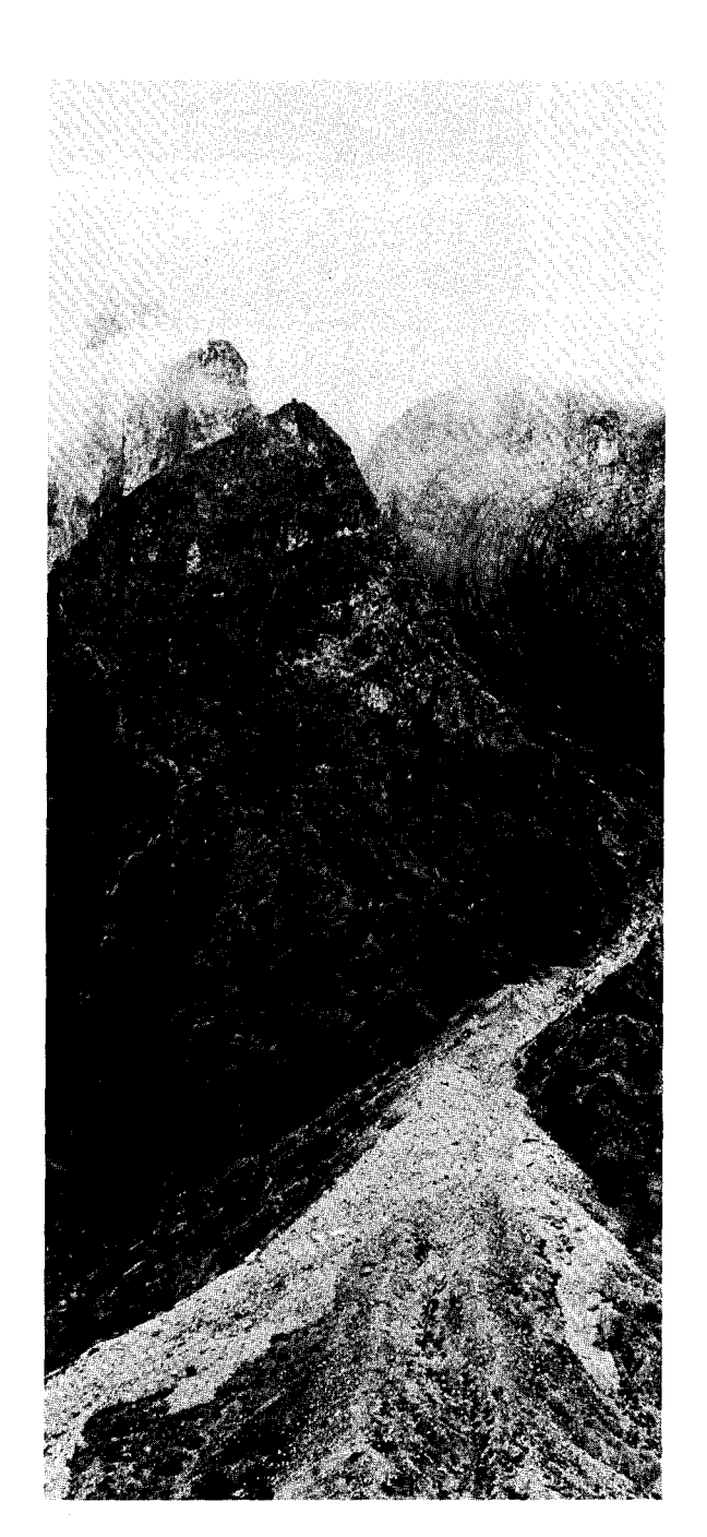
Pamir-Alai Mountains near Khamzaabad south of Fereana (habitat area for Sorbus tianschanica and Betula tienschanica).

The higher north faces of the Pamir-Alai mountains are often thickly covered with juniper forests of three species. The lower altitudes are dominated by the dark dense conical crowns of Juniperus seravschanica, and the middle and higher areas give way to the more open light green crowns of J. semiglobosa (Fig. 2). The latter is distinctive in having pendulous branchlet tips and smaller cones. The high altitude species, J. turkestanica, forms a slow-growing globular shrub. Some of the junipers attain large proportions and are reputed to attain an age of up to 2,000 years. In more open areas within the junipers, Sorbus persica are found and at higher elevations S. tianschanica. Betula tienschanica form groups of showy trunks, creamy white with shades of pink peeling bark, among the dark juniper foliage, and on grassy slopes near recently melted snow spring numerous minute white stars of Colchicum kesselringii (Fig. 3).