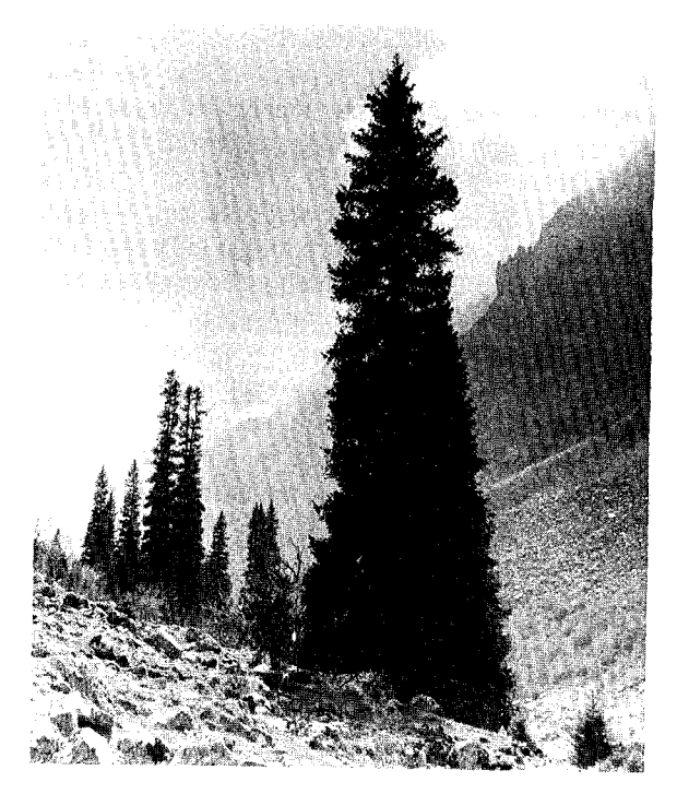
5. Picea schrenkiana and Sorbus tienschanica in the Tien-Shan Mountains south of Funje in Kirgizia.