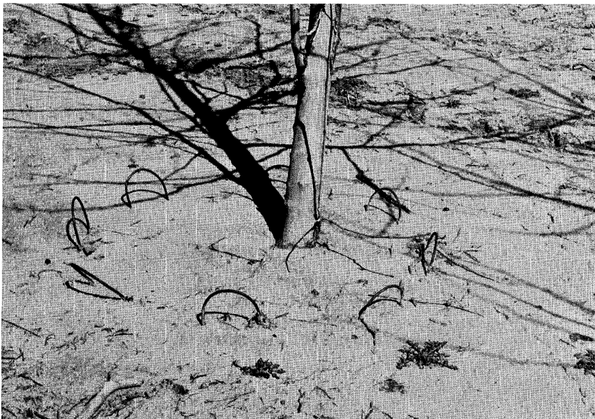
Fig. 1. Loops of wire basket above the soil surface. Weed control must be by preemergent herbicides and contact sprays since close cultivation around the tree is impractical.

Likewise, none of the tree roots had grown back under the plastic as was theorized by some viewers of the study during initial installation. Since the bottom of the basket was at approximately the plow depth during land preparation, the soil beneath the basket was more compacted and, thus, had a lower oxygen level and was probably lower in nutrients.