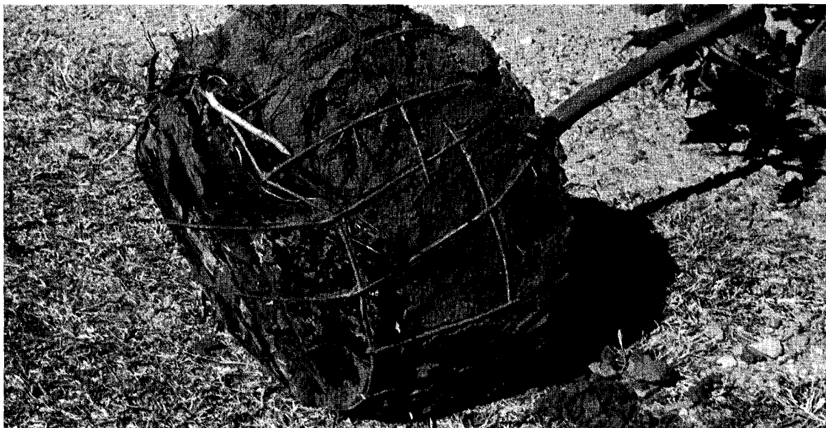
Fig. 3. Wire basket with top loops tied to secure the surface soil during handling. Note the black plastic in the bottom of the basket to prevent downward root development beneath the basket.

Department of Horticulture Oklahoma State University Stillwater, Oklahoma