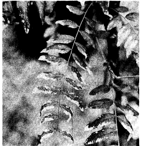
Figure 2. Marginal and interveinal, bifacial necrosis on Gleditsia triacanthos inermis 'Skyline' leaves one week after a 7½ hour fumigation with 1.00 ppm sulfur dioxide.

From monthly observations during the past three growing seasons at the Rikers Island and Cary Arboretum sites, and during the past two growing seasons at the Rutgers and New York Botanical Garden sites, it was evident that the most common type of air pollutant injury symptom present at all four sites was upper leaf surface stipple (flecking) characteristic of ozone (or oxidant) injury. While it is difficult to verify pollutant injury in the field, evidence from this study suggests that ozone (or oxidant) injury was common to a few cultivars at each of the four sites. First, the foliar symptoms in the field were nearly identical to those caused by the chamber fumigations with ozone. Second, only cultivars determined to be ozone-sensitive (in the chamber tests) showed foliar symptoms in the field. None of the ozone-tolerant plants was visibly affected by the field ex-