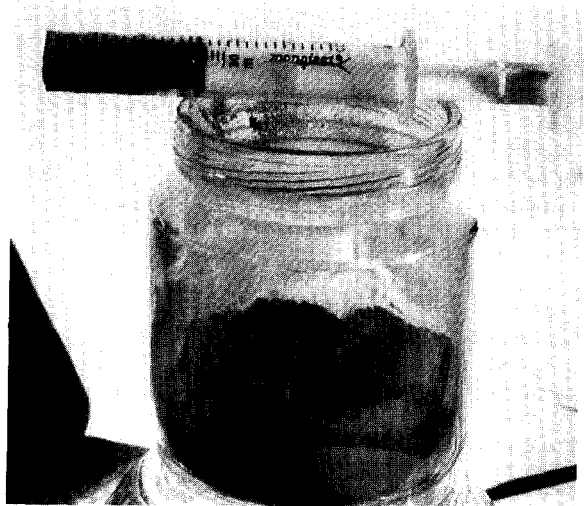
Fig. 2. A 3 ml plastic syringe with the tip end removed to facilitate loading with powdered ferric citrate.

In 1977, parkway pin oak and sweet gum trees were treated. Six types of Medicap treatments