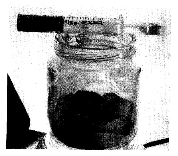
Fig. 2. A 3 ml plastic syringe with the tip end removed to facilitate loading with powdered ferric citrate.

In 1977, parkway pin oak and sweet gum trees were treated. Six types of Medicap treatments