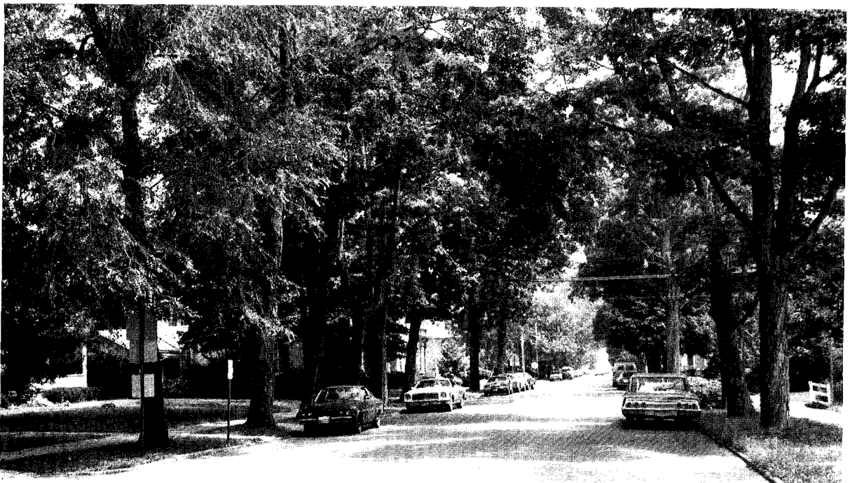
Fig. 1. Street trees in an older residential neighborhood. Trees such as these were the basis of our assessment of municipal tree-care practices.

Fourteen Ohio towns with populations ranging from about 13,000 to 82,000 were sampled. Four random points were located in each of the roughly equal quadrants of each town's map. The points marked the beginning for 16 sample street segments ranging in length from 0.2 to 0.6 mile each. For each sample the land use classification was noted, including the age of residential neighborhoods. We assessed all trees planted in the strip between road and sidewalk, or, lacking