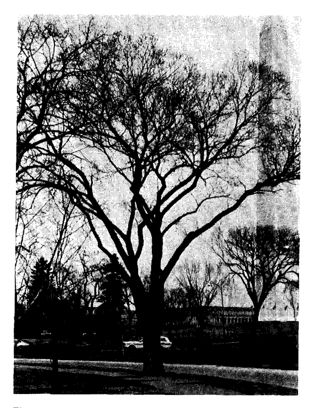
Fig. 4. American elm near the Washington Monument which received Dutch elm disease therapy in 1977 and has shown no further symptom progression.

populations where infections can be detected early and where special attention can be given to individual trees. Table 3 lists some guidelines which can be used in managing a therapy program.