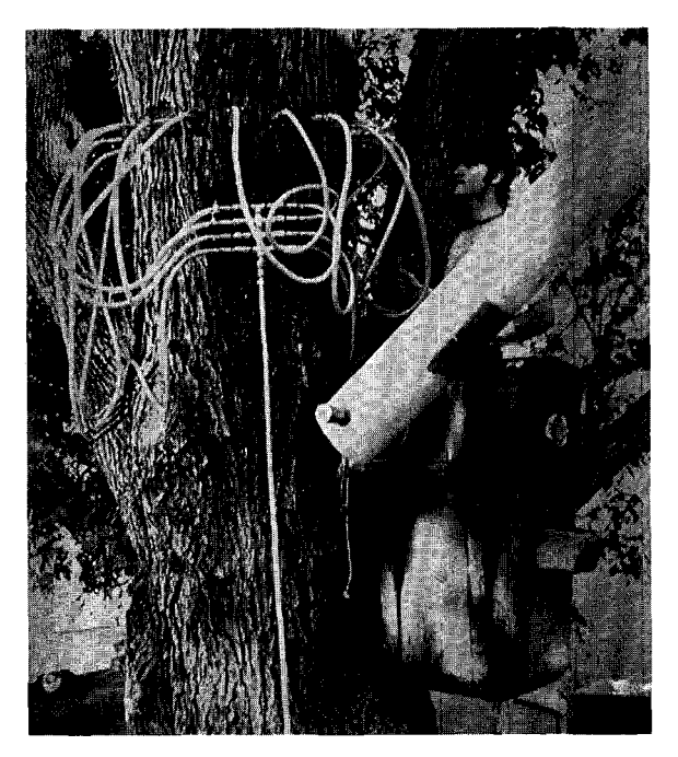
Fig. 2. Elm limb prepared for pressure injection.

All treated trees were examined for DED symptoms through 1979.