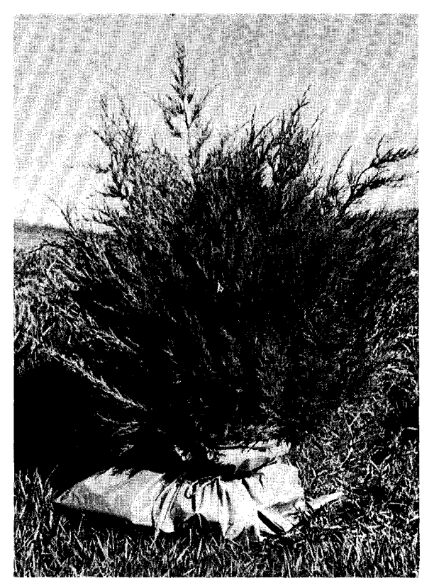
Fig. 1. Bare-root Grey Rock juniper treated with foliar antidesiccant and root-wrapped in PF poly bag.

Experiment 2. Based on the findings of the first experiment plant size was increased to 1.5-1.75m using Keteleer juniper ( Juniperus )