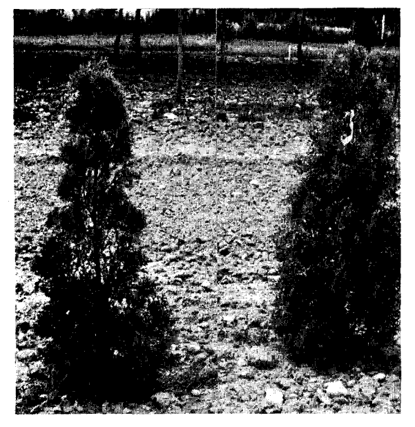
Fig. 6. Pyramid white cedar 15 months after transplanting. Left: Wilt-Pruf NCF + PF poly bag; Right: B&B (foliage more dense).

effect of Agricol on the plants. Agricol was not used in further trials due to the inconvenience in handling and lack of positive benefits. Mullin (1977) found no advantage in dipping roots of Jack pine or black spruce seedlings in Agricol prior to storage. The benefit of Agricol might be realized to a greater extent in situations where roots could not be wrapped immediately after lifting or during periods of very low relative humidity since the exposed solution remained moist during transport and overnight storage of yew and Grey Rock juniper plants.