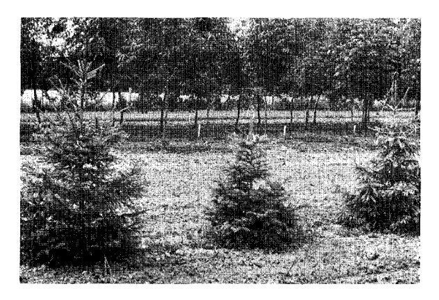
Fig. 5. Norway spruce 15 months after transplanting. Treatments left to right: B&B; Wilt-Pruf NCF; Wilt-Pruf NCF + PF poly bag.