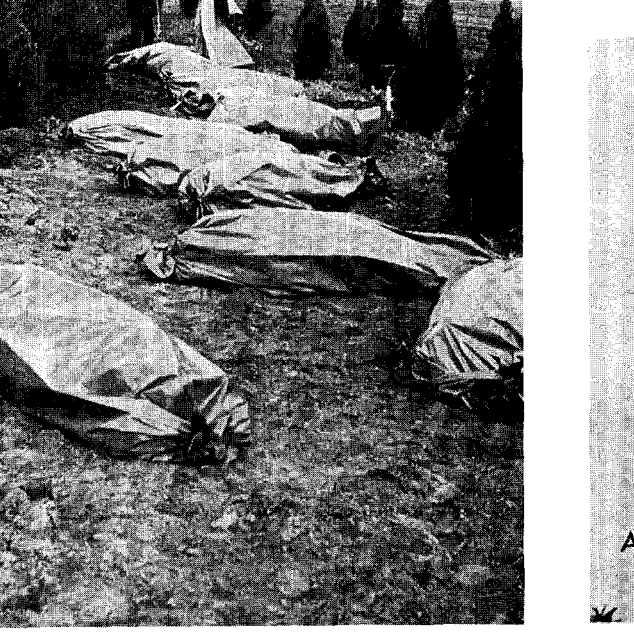
Fig. 2. Bare-root Keteleer juniper enclosed in PF poly bags.

Juniper. Plants in all bare-root treatments sur-