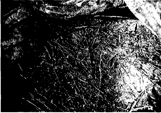
Figure 2. Many fine roots were observed in the interface between plastic and soil on all species.

tough, drought-resistant species, may restrict growth. Black plastic beneath the mulch made little difference in weed problems and provided no additional benefit to the plants compared to mulch alone.