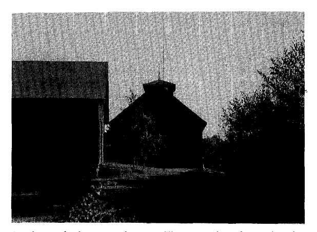
A view of the two barns. The meeting barn in the foreground is being adapted for program use; in the distance, the maintenance barn.

tion programs to extend public knowledge of forests and forestry; and (5) producing wood fibre and utilizing urban wood.