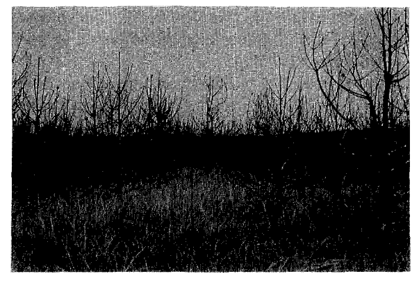
Recent fires have reduced the area of the red pine plantation by approximately one-half of the original size. A portion of this burned area will be used to study secondary plant succession and for several mini-woodlot demonstrations.

of wetlands and 90 acres of upland forests. Major vegetational types include: wetland-march (60 acres), red pine plantation (24 acres), Colorado blue spruce and white spruce plantation (4 acres), mainly evergreen woodland (37 acres), mainly deciduous woodland (18 acres), and scrubshrubland (7 acres). The natural stands of timber, both mixed hardwoods and softwoods, are the second largest non-planted cover types of native forest species found on the property. Various species representative of differing stages of forest succession may be found in this area. The existing vegetational types, both native and planted, are well suited for the ultimate uses of this area in urban forestry.