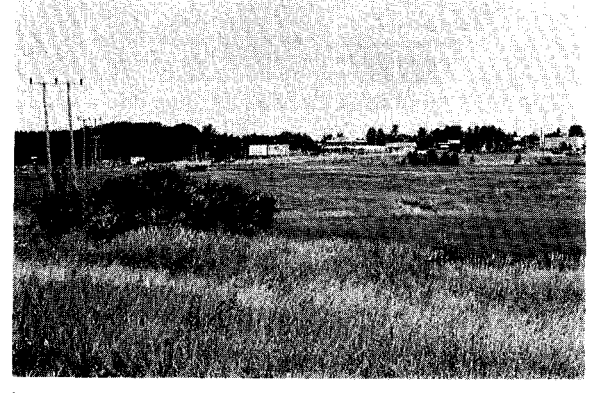
Looking northwest, a reminder of adjoining urbanization and U.S. Route 1.