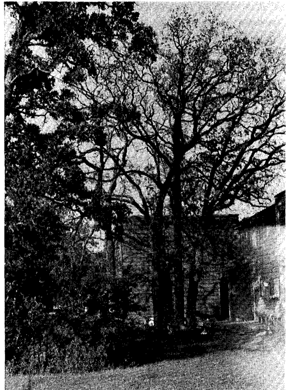
Fig. 1. Ditching for underground utilities was the apparent cause of loss of this group of post oaks which will not afford expected shade to this Texas home.