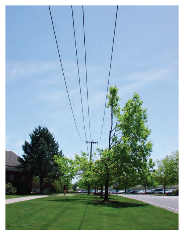
Figure 3. An asymmetrical crown resulting from line-clearance operations.

ground-to-sky trimming techniques (Gaffrey and Kniemeyer 2002). Furthermore, Kane (2008) found that pruning did not reduce a tree's overall likelihood of failure.