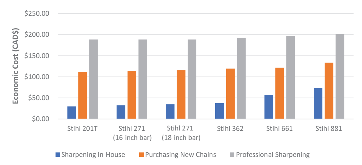
Figure 3. Economic costs of 3 methods of chain saw chain management. The economic costs are reflected in Canadian dollars (CAD). The economic costs shown here are for common Stihl<sup>®</sup> chain saws used in arboriculture operations.

In reviewing the fourth research question, economic models were reviewed to determine components of operational management which have the greatest reduction in accounting and economic costs.