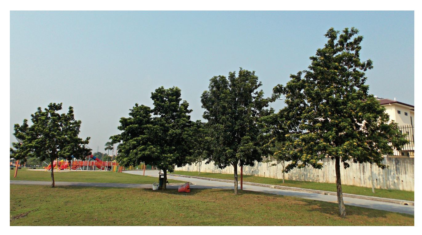
Figure 1. Xanthostemon chrysanthus planted by the roadside of Metropolitan Batu Park.

Apart from use of PBZ, correcting issues with culture and remedying nutrient and other deficiencies will typically increase tree growth. However, the application of suitable treatments on landscape trees can be overlooked, hence causing a decline in the growth performance of the trees. For instance, potassium is an essential nutrient and is required for desirable growth of plants. It is essential for the activation of over 80 enzymes throughout the plant (Mengel 2007), improving the plant's ability to withstand extreme conditions such as cold and heat, prolonged drought, and pest and disease attacks (Umar 2006; Thomas and Thomas 2009). Trees planted in urban areas are easily exposed to these growth challenges and need additional attention to ensure their survival.