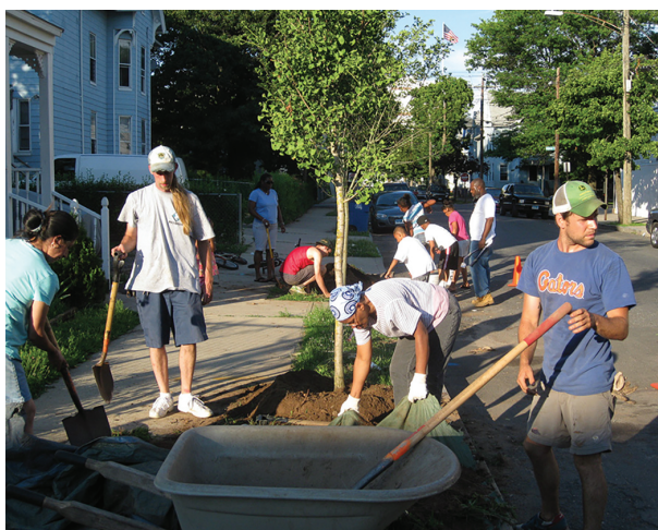
Figure 2. Community Greenspace interns supervising volunteers on a street tree planting project.

that they are interested in and where they wish to work. They also carry out the physical labor to achieve their project goals and commit to long-term stewardship and care of their Community Greenspace site. Since the program began, 298 different groups have participated with an average tenure of 4 years and a maximum tenure of 24 years.