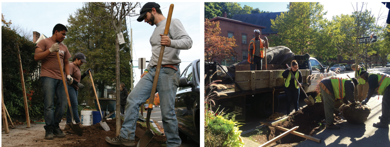
Figure 3. GreenSkills supervisor leading high school crew members (a) and adult crew members (b) in street tree plantings in New Haven, CT, USA (photo credit: Urban Resources Initiative, 2016 and 2015 respectively).

We employed an iterative, mixed-method approach to assess the effectiveness of URI’s field training opportunities for students in urban and community forestry. This methodology involved gathering data on the history, structure, and learning outcomes of URI’s field-based programs from multiple sources. First, we conducted semi-structured interviews with both current and former URI interns and staff who helped us identify the programs’ strengths and weaknesses. After preliminary analysis, these responses informed an