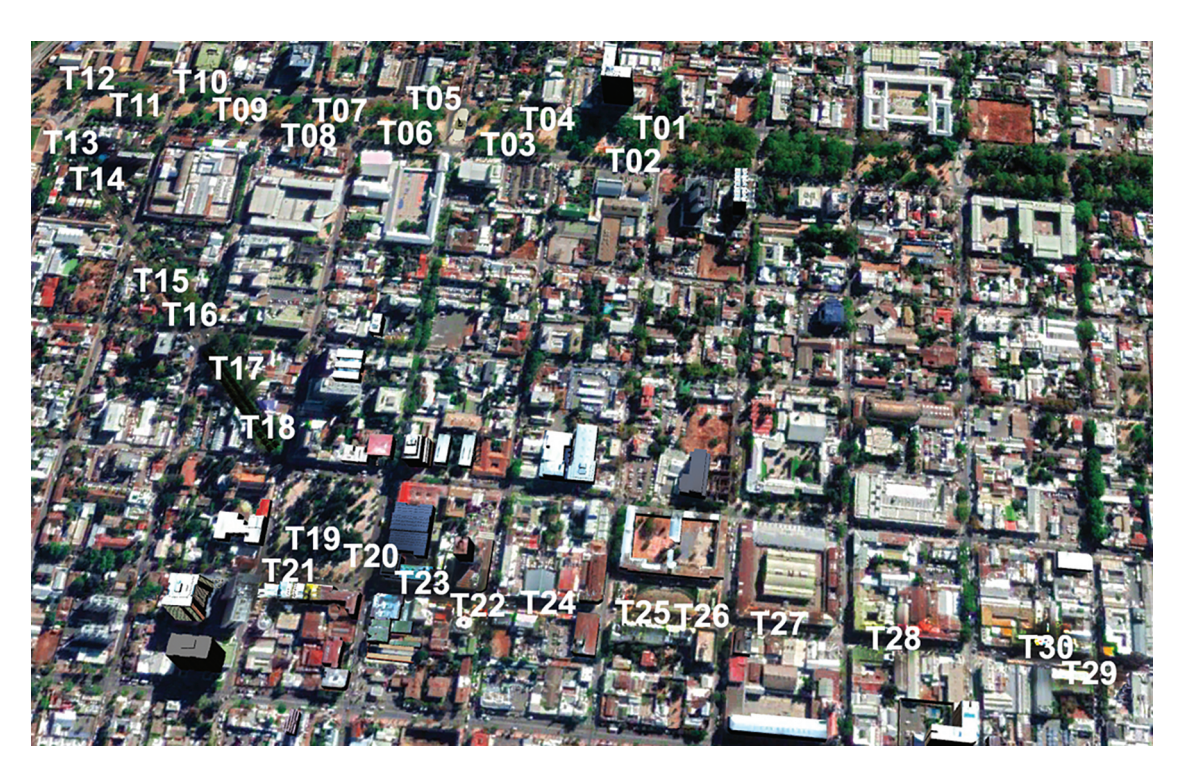
Figure 2. Location of plots.

square (also called Plaza de Armas)(T13 – T20). The third area is the street named 1st South (Uno Sur), which is the principal commercial zone of the city and has the least densely populated area of trees of the three areas considered (T21 – T30)(Figure 2).