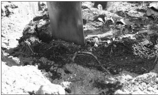
Figure 1. Shaving the root ball at planting (note root pruning spade cutting roots from outer 4 to 5 cm of root ball) after backfill was added to the planting hole. Removed roots and substrate were left in place as shown. Trunk is visible at top of photo, to the right of the pruning spade.

Water was added to settle backfill soil, and soil was tamped lightly by foot to standardize compaction. No berm or water ring was constructed around the root balls. Trees were mulched in a 1.6 m wide strip up to the trunk along each row immediately after planting with a mixture of aged wood chips, bark, and leaves from a local line-clearance contractor, which is common in many North American landscapes. Trees that were planted high were mulched with 5 cm on the root ball and 10 cm outside the ball; in addition to the 10 cm of soil, those planted deeply had 10 cm mulch over the ball and outside the ball. Vegetation between rows was mowed periodically; weeds in mulch were kept in check with three or four annual applications of glyphosate (isopropylamine salt, 41%). Trees were irrigated daily through three Roberts Spot-Spitters (Roberts Irrigation Products, Inc., San Marcos, Idaho, U.S.) positioned at the edge of the root ball directed toward the trunk. Thirty liters of irrigation were applied daily through 2008 and then