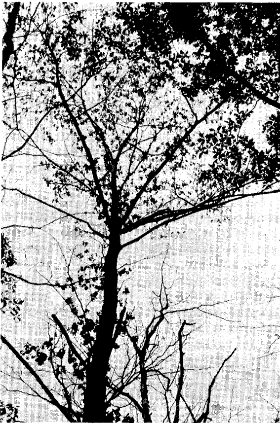
Figure 2. Defoliated tree that has refoliated; sprouting has occurred on the larger branches and main stem.

cutting cycle by 5 to 10 years to make up for the reduction in wood production. Either way it represents economic loss. Growth reduction has been shown to be proportional to the percentage of foliage removed and to the number of consecutive years of defoliation (Kulman 1971).