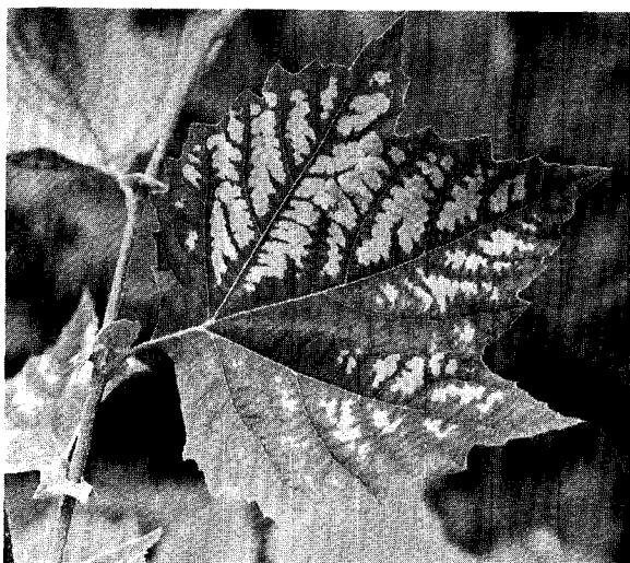
Figure 2. Sulfur dioxide injury in the form of interveinal necrosis on a 'Bloodgood' London planetree leaf. The injury occurred following an exposure to 1.00 ppm sulfur dioxide for 7½ hours.

fects, relative age of leaves affected, injury patterns (i.e., interveinal, marginal, stipple, etc.), and injury color. The pollutants suspected of causing the injury are noted, as well as insect, disease, or other stress factors that might be contributing to the injury. This field test will last a minimum of 3 years for each cultivar tested.