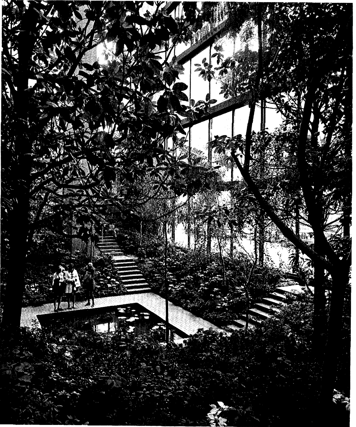
Ford Foundation — New York City