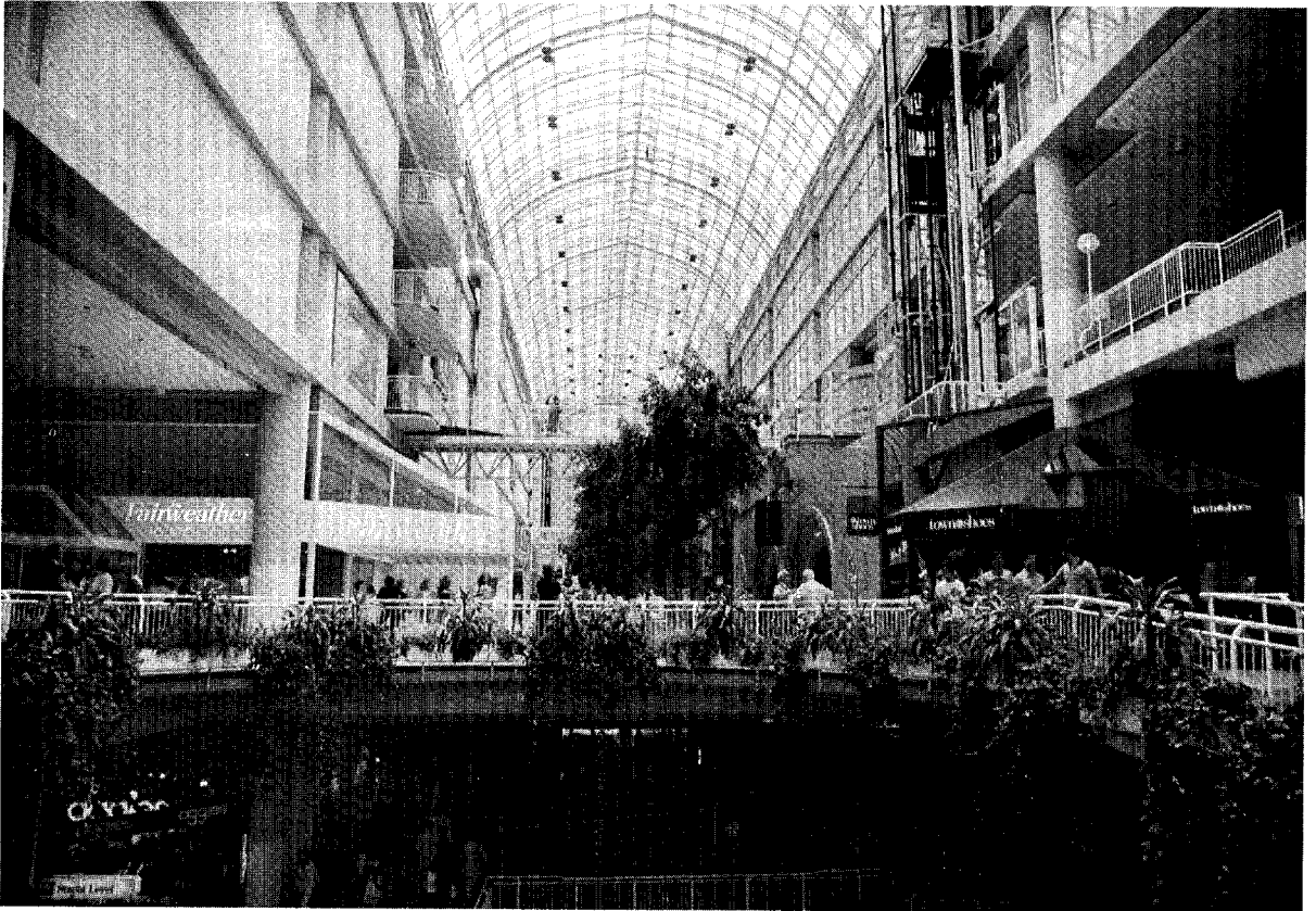
Fig. 1. Eaton Centre

less than adequate other symptoms such as leaf tip necrosis, stem rot, and root rot may be prevalent.