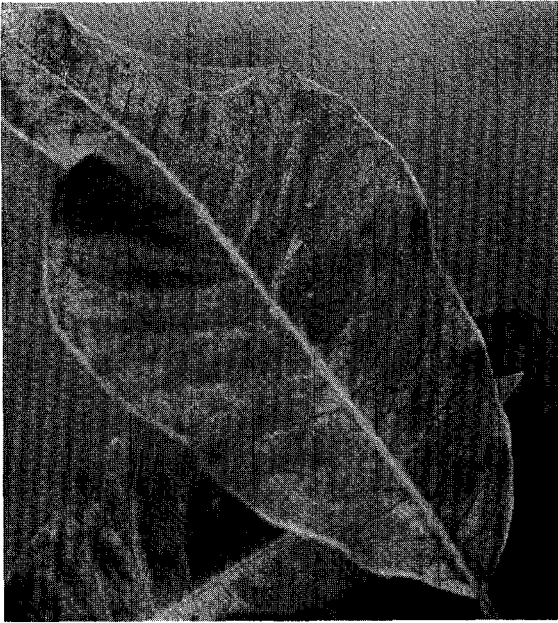
Fig. 4. Spider mite webs

Interior garden spaces in shopping malls, corporate headquarters, and banks are a part of modern living. Better use of natural light and spot lighting, better selection of plant material, and a better understanding of the plants requirements in a critical environment will inevitably produce a better landscape for both client image and employee morale.