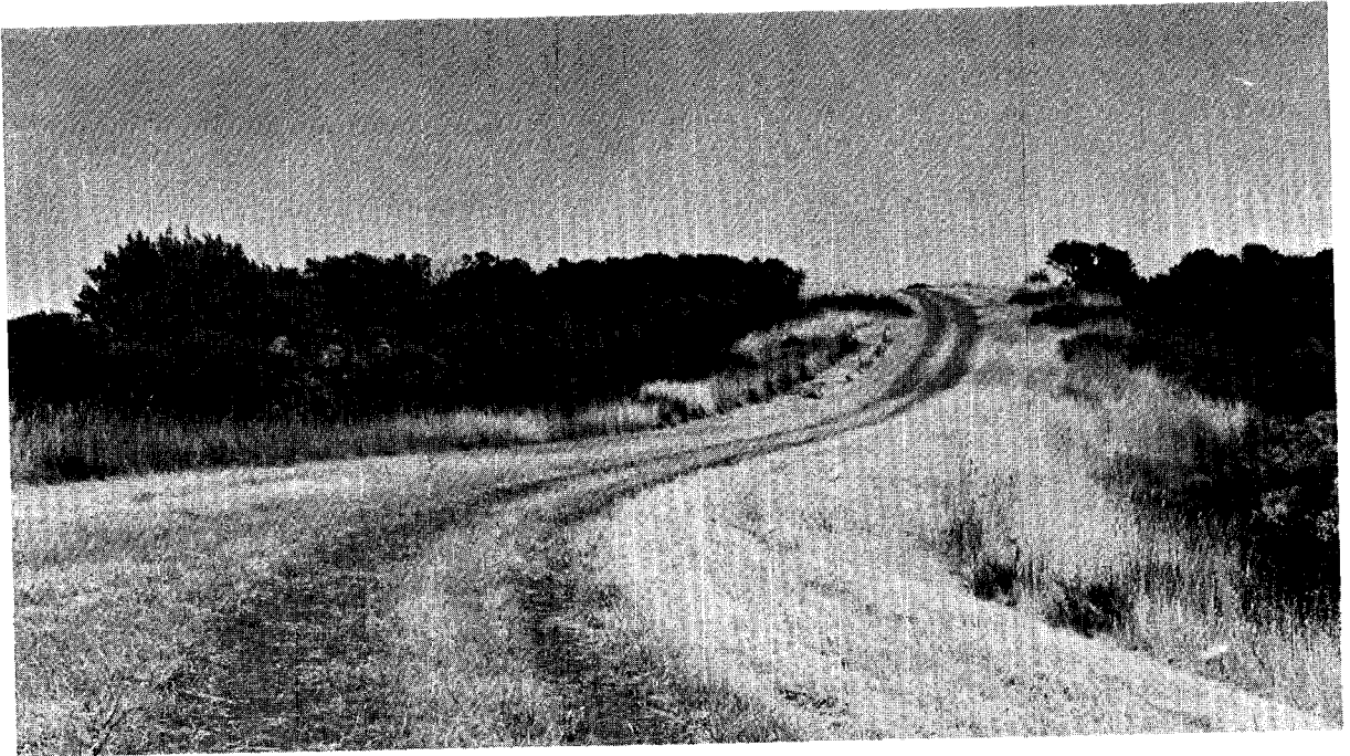
Fire break in the process of being converted into a fuel break.

which vegetation has been permanently modified to be lower growing, less dense and more fire resistant than surrounding brush.