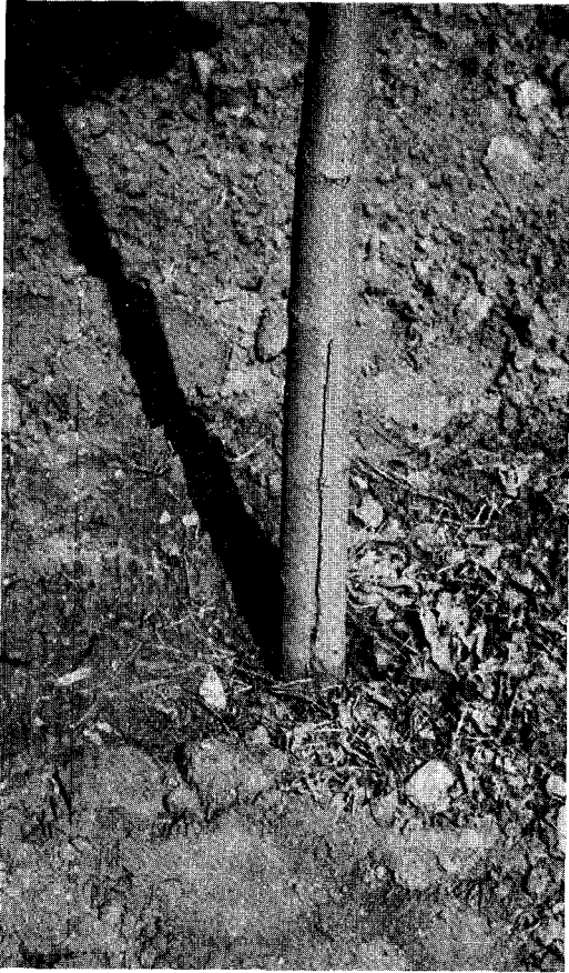
Figure 1. Frost crack on Acer platanoides cv. 'Emerald Queen', May, 1972.