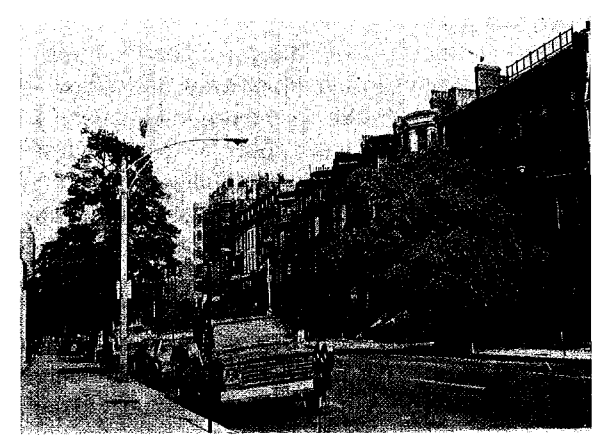
Beacon Street with only 23% of the linden surviving.

What do these individual survival rates tell us? Mainly that the average age of close to 10 years for sidewalk trees is the rule, not the exception. Sidewalk trees do not live long.