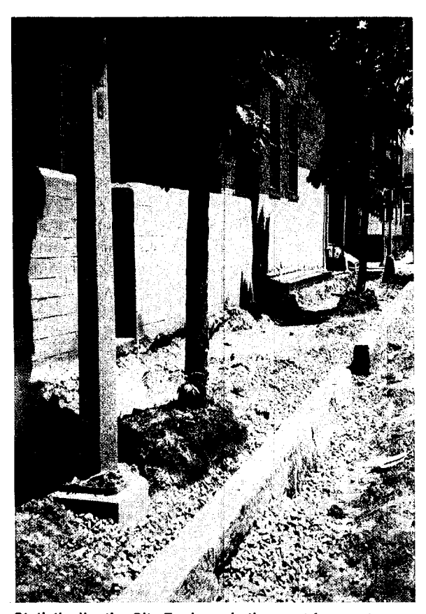
Statistically, the City Engineer is the most frequent cause of tree decline.

Autos are a significant factor. The wounds