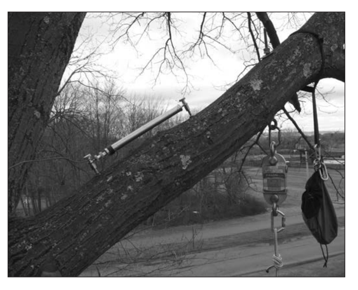
Figure 2. Branch showing, from left to right, strain meter (on top of branch), dynamometer and rope hung from eye bolt, and gear bag indicating location of rope from which drop mass was suspended prior to free falling and loading ascender.

prior to releasing it to load the ascender. The horizontal distance between the eye bolt and the drop mass was 225 mm (Figure 2).