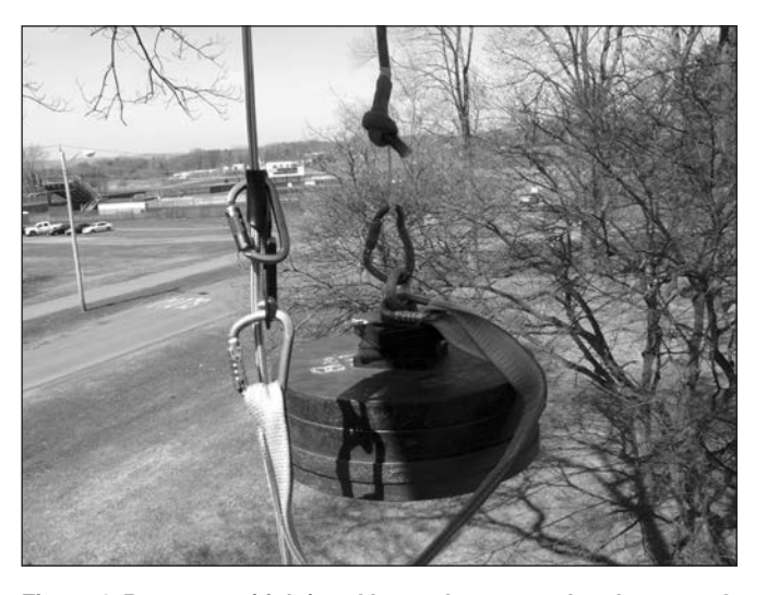
Figure 1. Drop mass (right) and lanyard connected to the ascender (left) and suspended by the short piece of throwline (attached to a larger diameter rope) prior to free fall.

A figure-eight loop was tied in each rope that was tested and connected with an ISC steel D-shaped carabiner (70 kN breaking strength) to a dynamometer (Dillon EDXtreme 11 kN capacity, accurate to 1 N, recording at 60 Hz). A second ISC steel D-shaped carabiner was used to hang the dynamometer from a steel eyebolt 16 mm in diameter that was secured in a branch approximately 12 m above the ground in a red oak ( Quercus rubra ). The branch was 265 mm in diameter at the point where the eye bolt was installed, 304 mm in diameter where it attached to the trunk, and oriented 65 degrees from vertical. The eye bolt was inserted through the branch 1524 mm from the point of attachment. A separate rope was hung on the branch 1798 mm from the attachment to hold the drop mass with a short piece of throwline (4 mm in diameter)