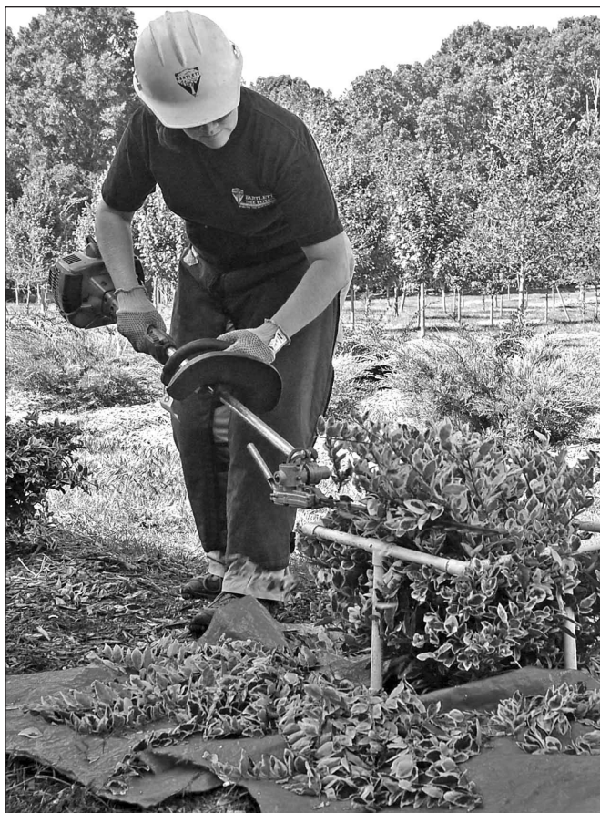
Figure 1. Shearing to the initial uniform size to determine growth biomass using a PVC frame to define the initial plant size and shape.

cal and Fertilizer Corporation, Hanover, PA) at a rate of 6.3 ml per 5 L (1.3 tsp/1.3 gal) of mix. Application rates were those recommended by the manufacturer from previous unpublished trials (Shawn Bernick, pers comm). Treatments were as follows: