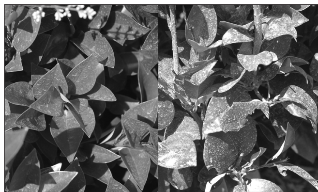
Figure 2. Residual from PBZ spray treatment shortly after applications were made. Left photo is of 1000 ppm application rate and right photo is with the 4000 ppm PBZ rate.

There was no distortion in growth or obvious reduction in leaf size with either treatment at any time during the trial. However, a white residue was clearly visible on the foliage of the plants treated at the 4000 ppm PBZ rate immediately after application (Figure 2). Minor amounts of residue were visible on the 1000 ppm PBZ rate plants. Residue was not visible on the 1000 ppm rate foliage at the end of trial, but the 4000 ppm rate plants did have some visible residue.