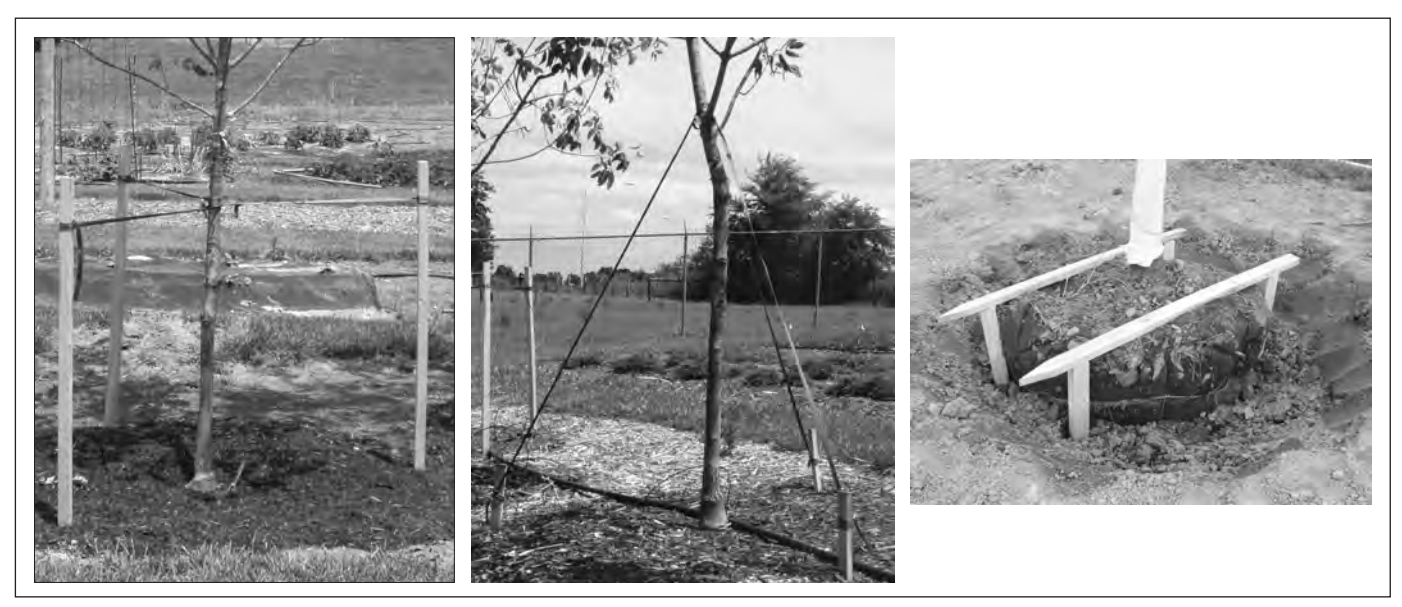
Figure 1. Tree stabilization systems evaluated on field-grown, balled and burlapped white ash ( Fraxinus americana L. 'Autumn Purple'). From left to right, staking, guying, and root ball anchoring.

three 5 cm × 5 cm × 91 cm (2 in × 2 in × 36 in) anchors were driven 61 cm vertically into the soil 76 cm equidistant from the trunk. A strap was attached to the base of each anchor with a clove hitch backed by a half hitch and secured around the trunk and over the lowest scaffold branch with a bowline. For the root ball anchoring system, four 5 cm × 5 cm × 76 cm (2 in × 2 in × 30 in) anchors were placed snug against the root ball on four corners and driven vertically into the soil until the top of the anchors were flush with the top of the root ball. Two 2.5 cm × 5 cm × 91 cm (1 in × 2 in × 30 in) horizontal braces were then placed on top of each pair of vertical anchors and secured across the root ball using four 5 cm (2 in) #10 wood screws. Root ball anchoring was installed prior to backfilling the planting hole.