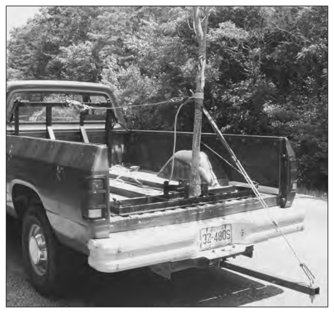
Figure 2. Truck-mounted tree sled used for measuring windinduced bending moment of white ash ( Fraxinus americana L. 'Autumn Purple') from 0 to 24.5 m/s (0 to 55 mph).

To determine appropriate wind-simulating forces for the TSS experiments, wind-induced bending moments were measured for a sub-sample of six ash trees using the method of Smiley and Kane (2006). Each tree was severed from its root ball just above the flare and secured in a steel sled mounted in the rear of a pickup truck (Figure 2). A prusik cord was tied around the trunk at a height of 83.8 cm (2.75 ft) and attached to a 1.8 m (6 ft) section of 0.6 cm (0.25 in) extra-high-strength steel cable using a steel carabiner and a microascender. The horizontally-oriented cable was attached to a 2268 kg capacity Dillon ED Junior dynamometer (Weigh-Tronix Inc., Fairmont, MN), which was then secured to the front rack of the sled. The truck was then driven on a straight, nearly level course from 0 to 24.5 m/s (0 to 55 mph). As the truck was driven, a passenger recorded the force measured by the dynamometer at 7, 11, 16, 20, and 25 m/s (15, 25, 35, 45, and 55 mph). For each tree, two runs were made in opposite directions to minimize the effect of directional winds and the force values were averaged for each speed interval. This procedure introduces a component of force due to vehicle acceleration, but Kane et al. (2008) estimated it to be less than 2% of actual drag. To calculate wind-induced bending moments, force values were multiplied by the dynamometer attachment height on the trees.