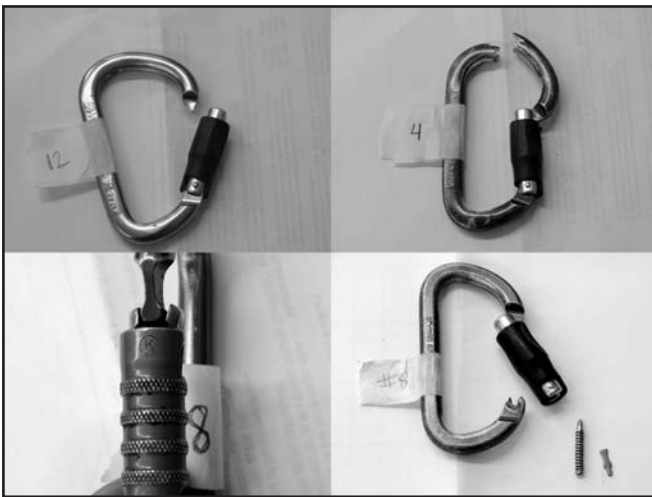
Figure 1. Types of failure of carabiners (clockwise from upper left): key, body, hinge, barrel.

We used the Kolmogorov-Smirnov test to confirm that data were normally distributed, with the exception of surface roughness measurements for Am'D Ball-Lock carabiners. For comparisons involving that variable, we used the nonparametric Wilcoxon's signed rank test to test hypotheses. We used a t-test to compare breaking strength, relative breaking strength, and surface roughness between new and used carabiners of each type, after confirming homogeneity of variance within each comparison by Levene's test. We used one- and two-way analyses of variance (ANOVA) to compare the response variables listed above between failure types and carabiner types (classified by condition), respectively. Where appropriate, we used Tukey's honestly significant difference to test multiple comparisons within each ANOVA. We used regression analysis to investigate the effect of surface roughness on breaking strength.