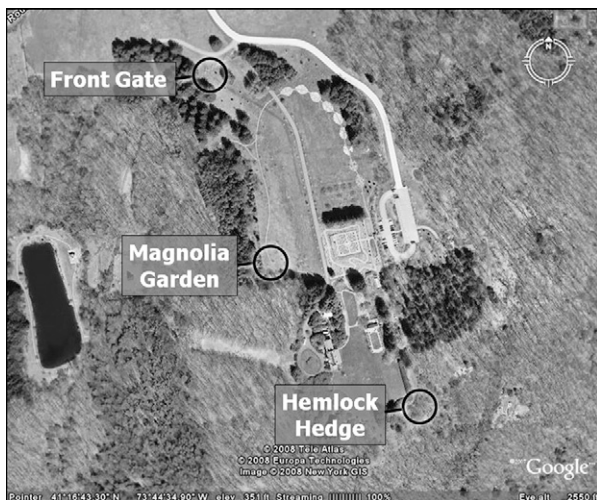
Figure 1. Layout of plots at Lasdon Park and Arboretum, Katonah, New York, U.S. Distance from top of figure to bottom represents approximately 500 m (1650 ft).

Each plot was roughly 12.2 m × 13.7 m (40.3 ft × 45.2 ft) in size and had six rows of trees 12.2 m (40.3 ft) in length (spacing within and between rows was approximately 2 m [6.6 ft]). Each row was intended to have one of each of the seven test species plus a second representative of T. canadensis , which was to serve as a negative control (after pesticide application) for that species after adelgid establishment; the order of trees within a row was