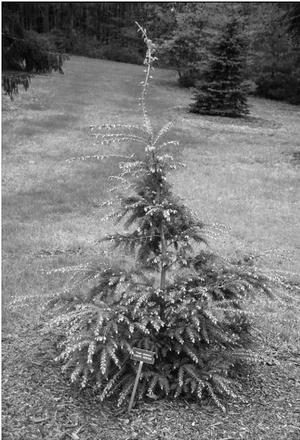
Figure 3. Photograph of Tsuga chinensis .

( \chi^2 = 8.92 , P = 0.0028 ). There was no association between the two insects on the other test species.