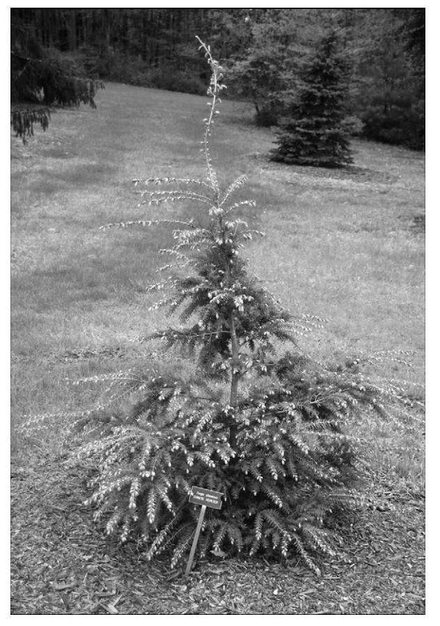
Figure 3. Photograph of Tsuga chinensis.

(\chi^2 = 8.92, P = 0.0028) . There was no association between the two insects on the other test species.