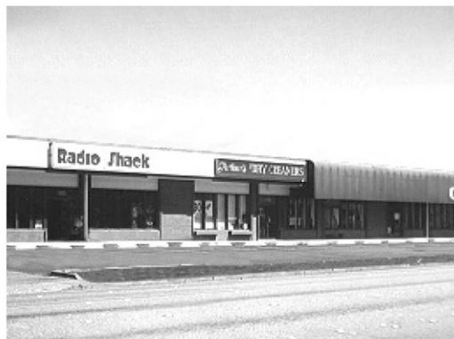
Figure 2. Image preference categories.