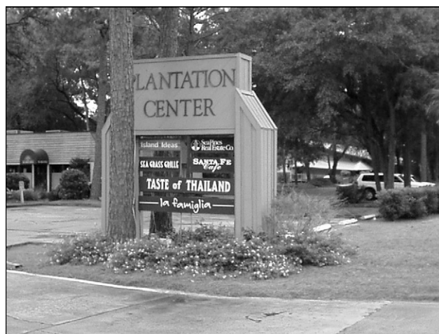
Figure 3. Streetside monument signage.

Signage may be the ultimate point of tension concerning tall vegetation and business visibility. Individual businesses typically have large signs above their storefronts, ideally visible from the road, and may have individual signs closer to the road. These signs are often placed at considerable cost.