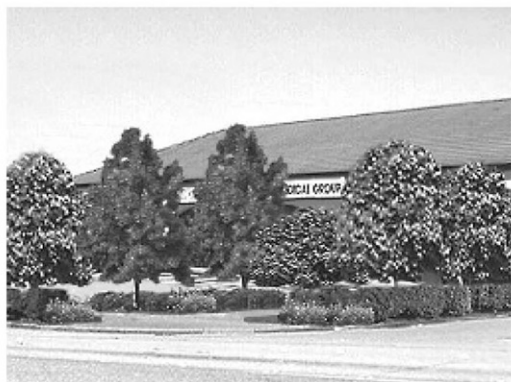
2: Ordered Trees, mean 3.09, 0.78 sd