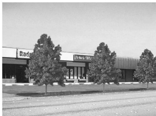
3: Shrub Edge, mean 2.35, 0.96 sd