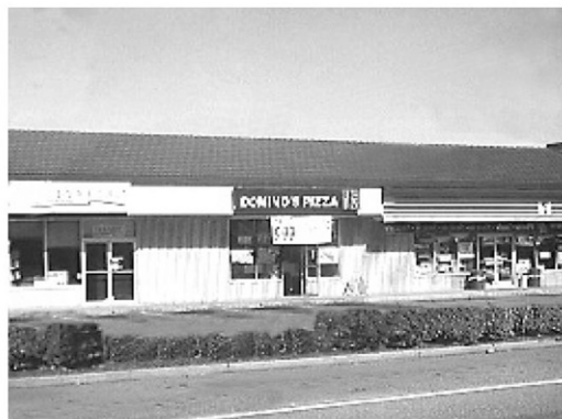
4: No Vegetation, mean 1.39, 0.83 sd