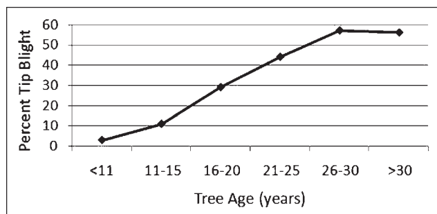
Figure 1. Relationship between tree age and average percent tip blight for all trees surveyed for all observation years. Number of trees evaluated per age category over all 8 years of observation ranged from 26 (greater than 30) to 1043 (16 to 20).

The effective dose for complete inhibition of D. pinea hyphal growth on PDA amended with fungicides can be determined from the data presented in Table 2. Based on this test, tebuconazole completely inhibited fungal growth at a rate of only 1 ppm. The effective dose may be even lower, but this concentration