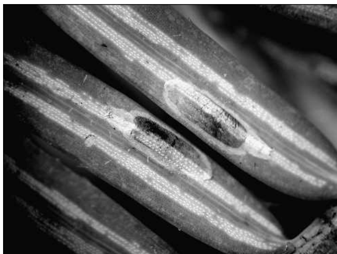
Figure 1. Elongate hemlock scale is one of the most destructive armored scales attacking hemlocks and other conifers in the United States.