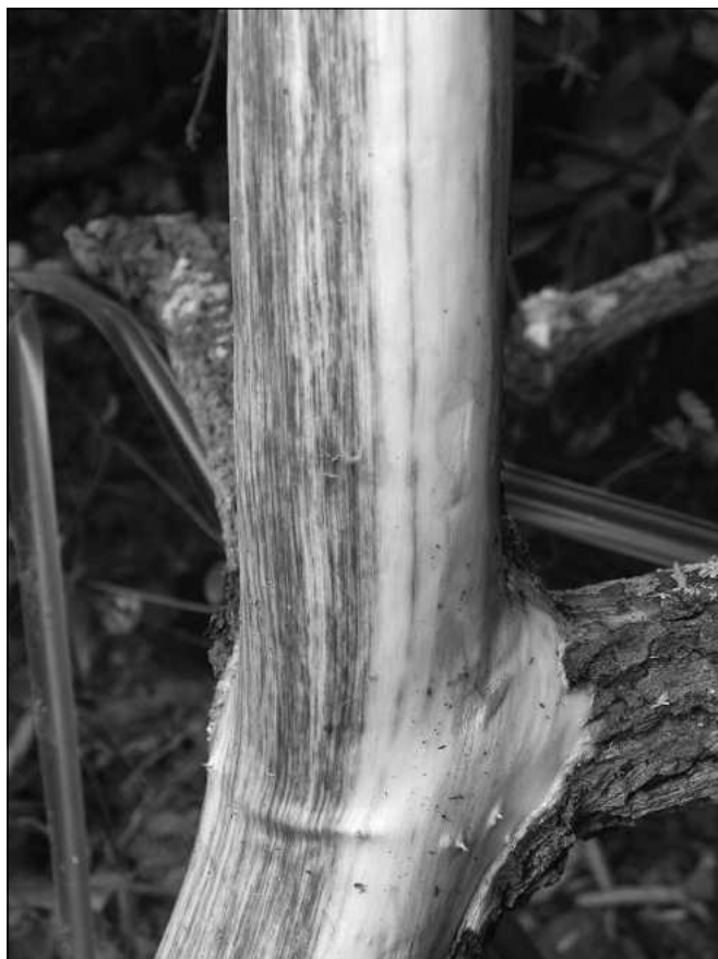
Figure 3. Black discoloration in the outer sapwood of a redbay tree 6 weeks after artificial inoculation with the laurel wilt pathogen, Raffaelea spp.

∇ Among trees inoculated with Raffaelea spp., the proportion of trees from which Raffaelea spp. was reisolated significantly differed between the propiconazole group and the untreated group ( \chi^2 = 13.33 , P = 0.0003 ).