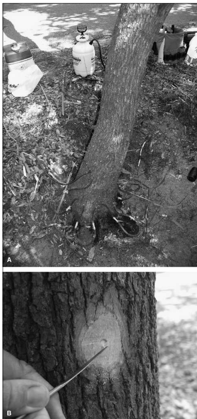
Figure 1. Macroinjection of redbay tree with the fungicide propiconazole (A). Inoculation of redbay trees by placing an agar plug with the laurel wilt pathogen ( Raffaelea spp.) into a hole in the outer xylem (B).

On 19 April 2007 (2 to 3 weeks after fungicide injection), all 20 trees (fungicide-treated and control trees) were inoculated with Raffaelea spp. Two isolates of the fungus were used, one from Ft. George Island, Florida (FG) and one from Hilton Head Island, South Carolina (HH5) (isolates provided by S.W. Frae-