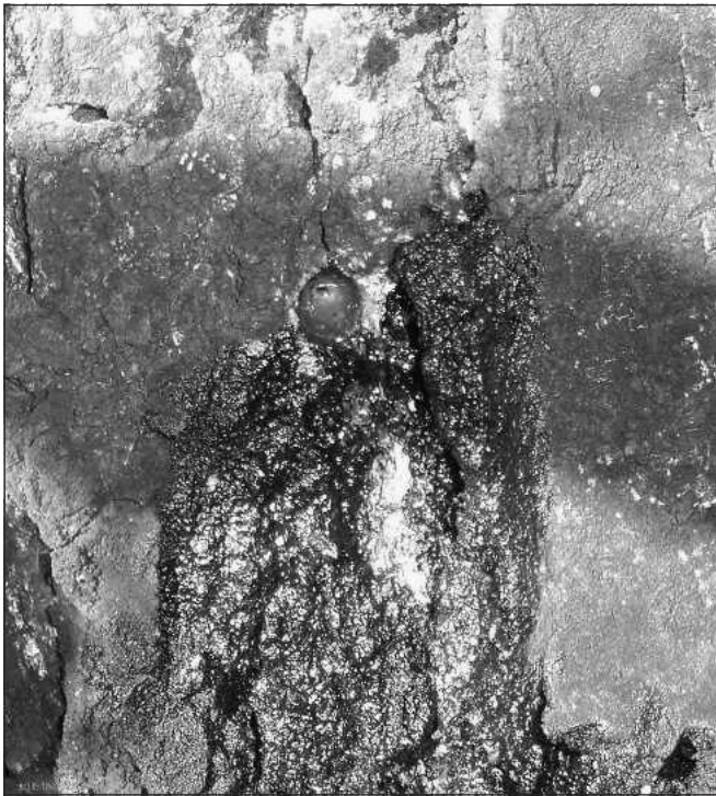
Figure 1. A bleeding wound in the bark of sugar maple ( Acer saccharum ) created by sapsucker ( Sphyrapicus varius ).

March 2006 by counting the active and bleeding wounds on each treated and untreated section of stem. After treatments were removed on 11 March 2006, all previously covered areas were inspected for the presence of previously undetected sapsucker damage.