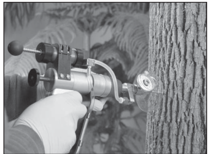
Figure 1. The Arborjet VIPER injection device, equipped with tree gauge to indicate injection pressure in the sapwood, and top mounted 10 mL Dose-Sizer™ to measure amount of formulation applied.

the most environmentally sensitive approach to pesticide application, but wounding and the possibility of subsequent girdling are of concern to the arborist. Arborjet VIPER microinjection was designed to address the concerns of environmental sensitivity and wounding of trees. It limits the number of injection sites set circumferentially around the trunk. The Arborjet VIPER system was selected for use in therapeutic treatments in this study (Figure 1).