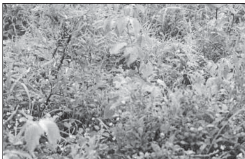
Figure 2. A basal low-volume spray unit (BLV-3). Note the diversity of plant species in this unit.

found that exotic species were more common in forests and grassland near habitat edges, such as those at a road interface (Brothers and Spingarn 1992; Tyser and Worley 1992; Watkins et al. 2003; Pauchard and Alaback 2004). If forest roads in our study were paved, the number of exotic plant species could have been higher (Lundgren et al. 2004). Because units relatively isolated from state forest roads tended to have fewer exotic species, these sections of the ROW can serve as refugia for native flora (after Strittholt and DellaSalla 2001).