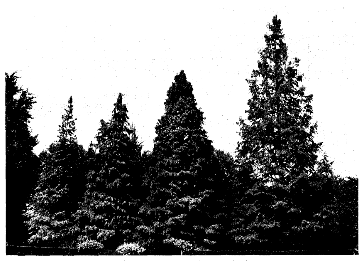
Taxodium distichum, swamp cypress. Specific variation is clearly demonstrated by this seed-raised group of T. distichum . This vigorous, formal, deciduous conifer makes an ideal specimen landscape subject, especially suitable for city plantings.

Demonstration Center. The latter will serve an increasing demand for both theoretical and practical horticultural education.