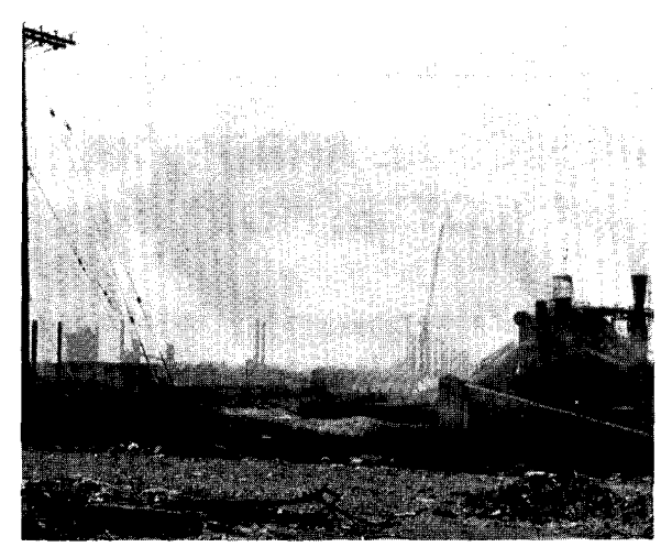
Fig. 3. Air pollution has become an important urban stress factor in the past 20 years. In addition to the physiological consequences of air pollution, a number of importnat mesoclimatic changes can occur because of atmospheric contamination.

Fig. 2. Large-scale applications of chemical compounds for pest control and snow and ice removal make chemical stress an extremely important consideration in the urban environment.