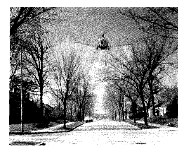
Fig. 2. Large-scale applications of chemical compounds for pest control and snow and ice removal make chemical stress an extremely important consideration in the urban environment.

Indiscriminate use of chemical compounds can significantly alter soil pH. Most tree roots grow over a considerable pH range, but reduced growth is often observed at pH values below 4.0. Changes in soil pH may indirectly influence tree growth as a result of differences in the solubility of inorganic nutrients as well as alterations in the activity of soil microorganisms responsible for nitrification.